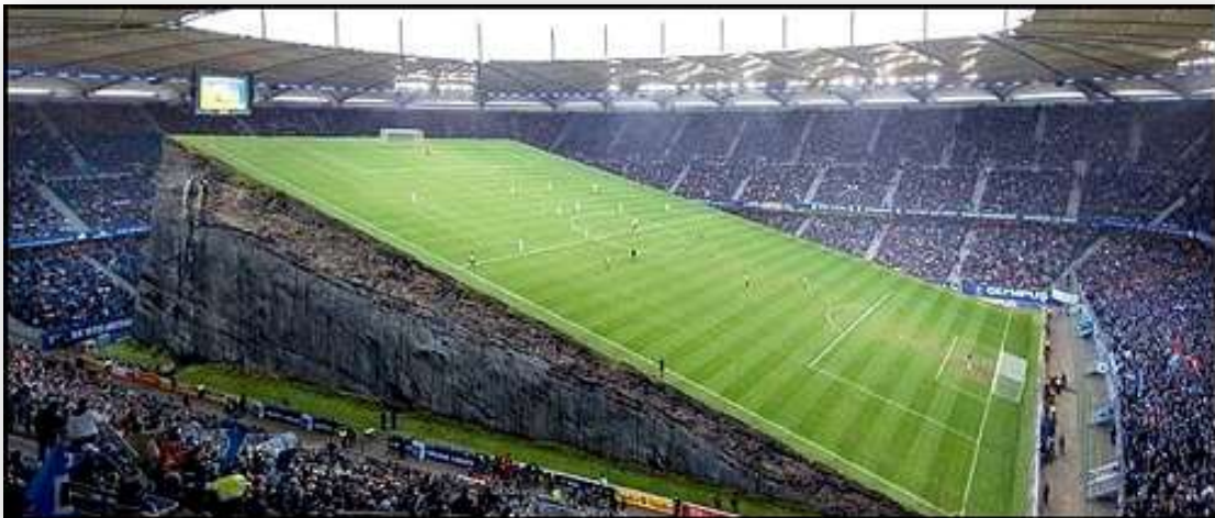
Figure 6 – an uneven playing field

This is number two on the list; however, it is the most important thing to do. You must let your children know that these meetings are only to help them grow and that you love them, Let them see it that you are not trying to force something on them that they don't want.