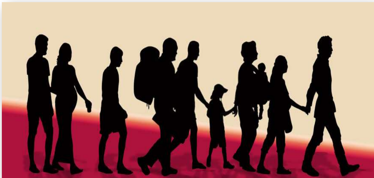
Figure 4 – a family enjoying life

Well, I could go deep into this, but since this book is more about how to hold one, I won't. Rather, I will say that the reason you need to have a parent /child council is to parent with a purpose — this is to be a parent with logic and love. Actually, the goal is to parent and not to just be a parent.