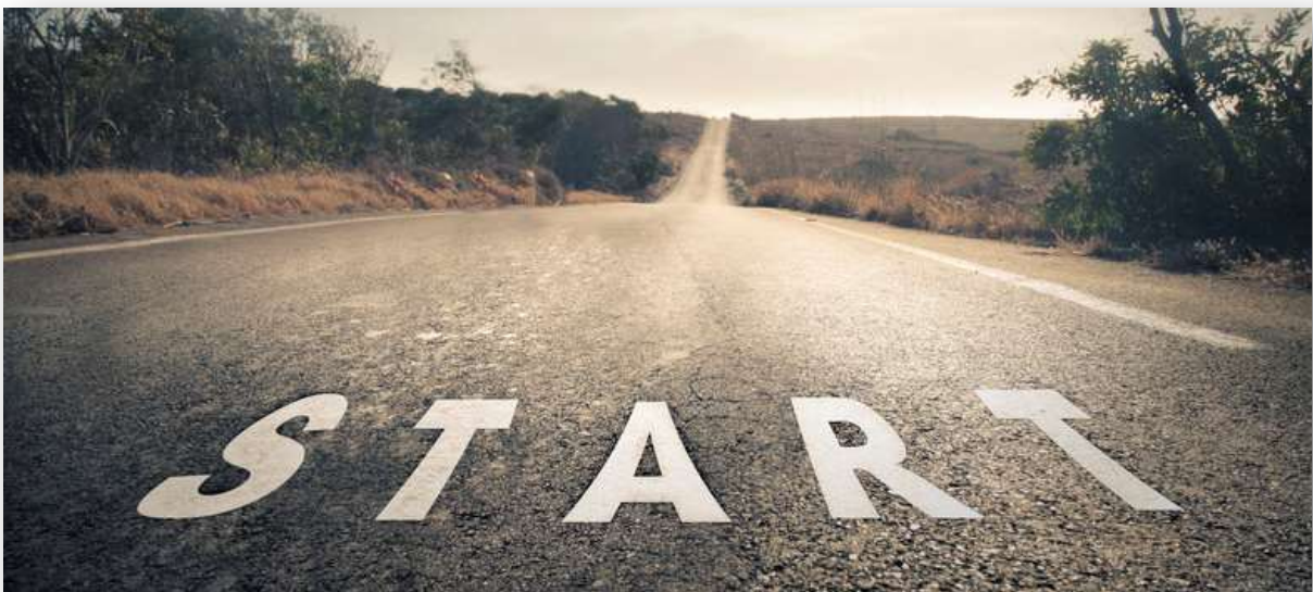
Figure 1 – Start with the end in mind