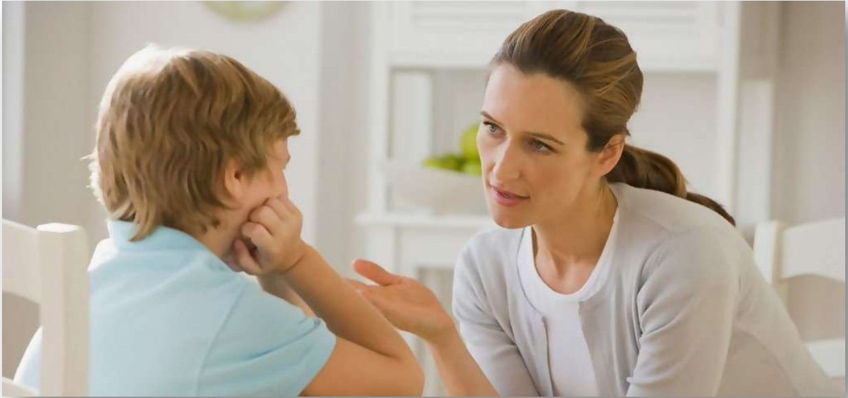
Figure 5 – a mother and child in council

Ok, since you now have a little understanding about why I am doing this and why you should do this, let's get into the meat of things. Let's talk about holding a successful council.