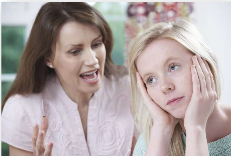
Figure 11 – mother nagging daughter

Do you want your children to listen to you? Do you want them to take your advice? Do you want them to participate with you in these meetings? Then if so, when you are outside of the sessions, you need to do everything you can to resist