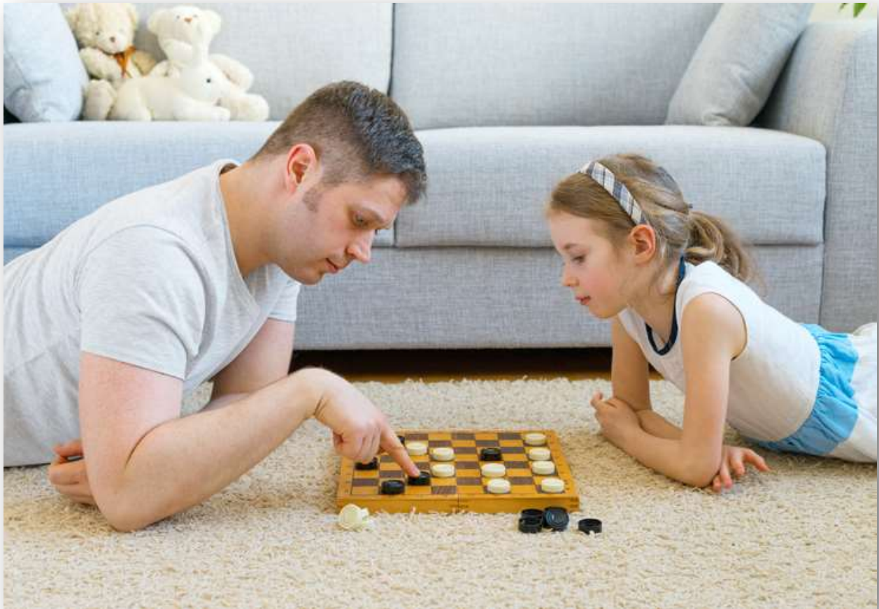
Figure 9 – father daughter checkers

I ask them questions as to see what they think (don't ask yes or no questions, ask questions they need to think about). I try and give them several perspectives of my thoughts on the subject matter. Some of my lesson have object lessons to help drive home the point but it is a good way to get your child mobile. You don't have to do this but sometimes I will plan these lessons for the entire family and we will go out to dinner. This isn't always the best as you do need and want that one on one interaction with your child.