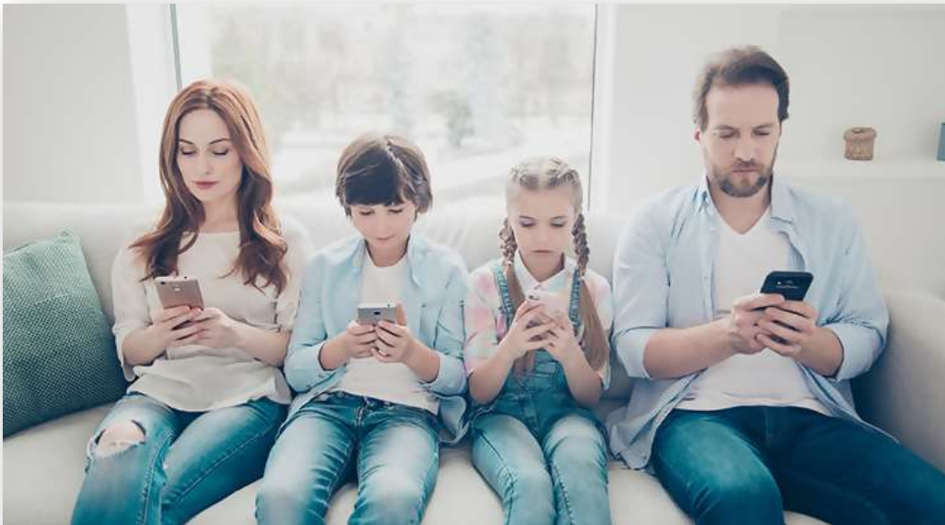
Figure 2 – An electronically engaged family

As parents, we must develop an interest in our children's lives. We have to know and understand the things they are going through. We need to understand their thoughts and viewpoints. We need to teach them to fish instead of handing them a fish . I believe that nowadays, parents spend more time with their kids than ever before. I know that may sound counter intuitive. But we have more free time so we are spending more time with them. But the question is, what are we doing with that time?