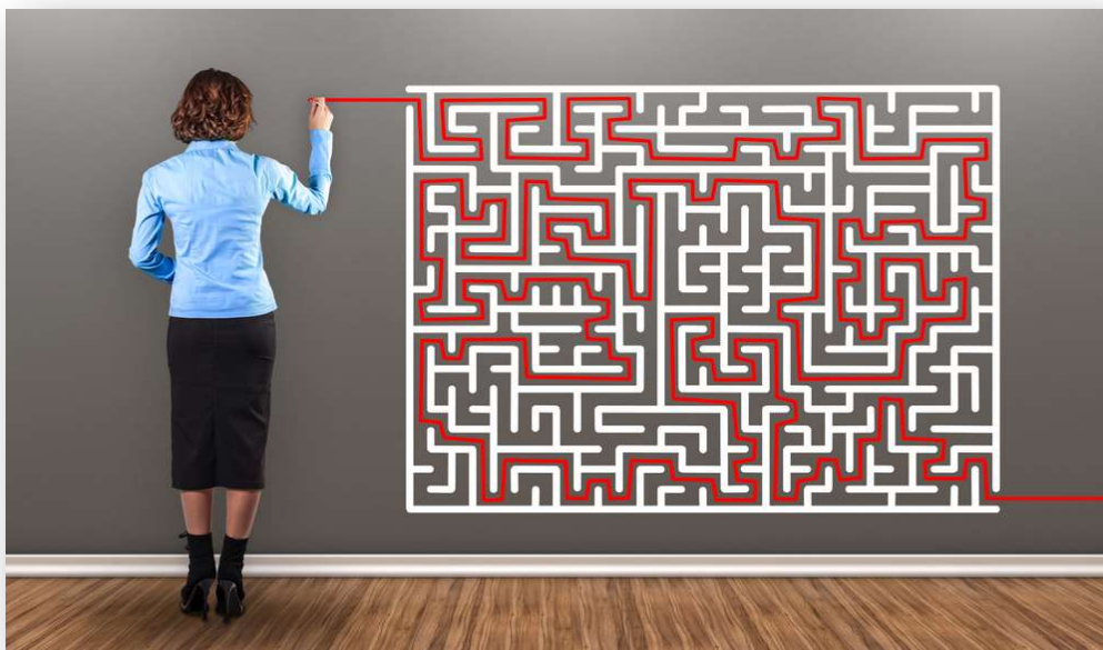
Figure 10 – female starting with end in mind

I give suggestions as to what might be good things to a journal. We talk about when journaling the downtimes that you take time to reflect and find out what lesson you can learn from this experience. I also add the things maybe what helped to get out of the rut.