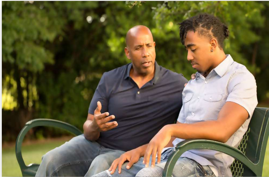
Figure 3 – a father having the right discussion with his son

This is an excellent place to discuss those things in life that are truly going to matter and to discuss the things that are going to make the biggest impact on your children. Yes, it is also a great place to plan and discuss household chores and upcoming activities. It is the ideal place to discuss life, friends, school, and the future in a loving and safe environment.