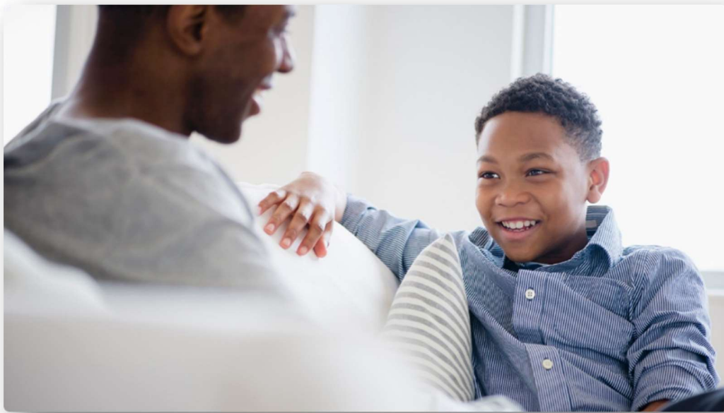
Figure 8 – father son council

Gaining trust by letting your child know that you care what they think and that you care about them. How do you do this? You do it by listening to what they have to say. Don't interrupt them but wait for them to get done talking. The things they say is just as important to what you say. Ask them questions that pertain to what they are talking about and let them talk. This shows you are listening and that you care. Take time to really think through what they are saying and if need use the reflective listening technique.